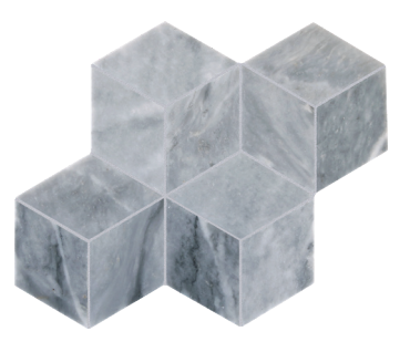
CS-Deep Blue Honed Rhomboid Mesh