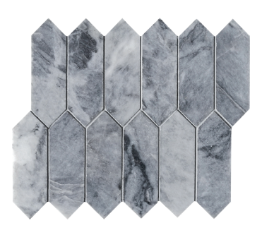
CS-Deep Blue Honed Picket Mesh