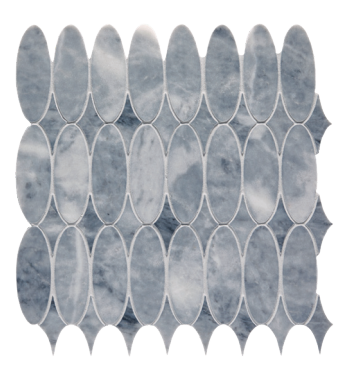
CS-Deep Blue Honed Oval Mesh