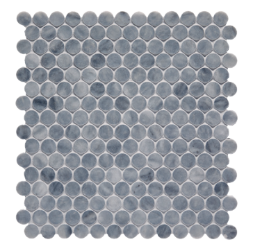
CS-Deep Blue Honed Penny Round 3/4 Mesh