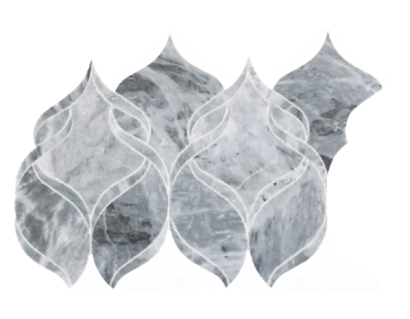
CS-Deep Blue Honed Ribbon Mesh