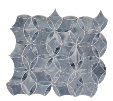
CS-Deep Blue Honed Flower Mesh

The Completa Series (CS) is a collection of natural stone tile, trim and mesh mount designs offered in six color collections each with 12 or more mesh mount variations. Each mosaic variation is artistically crafted with exclusive materials strategically arranged to display the material in unique and breathtaking designs. Shown here is CS-Deep Blue which is a rich blue marble with very faint, white details dispersed throughout each piece. Its striking blue tone creates a bold statement in any installation. A mesh backing is adhered to the back of each decorative mesh mount product. Because this series is comprised of natural stone, there will be noticeable variations in color and movement between pieces. Therefore, it is important and recommended that a range of this product be viewed before finalizing a purchase. Piece to piece variation in shade or color are inherent in all natural stone products; therefore, when installing natural stone tile, it is recommended to mix tiles from several boxes at a time during installation to achieve the best range of color. As natural stone products, it is recommended that these be sealed to extend their longevity. When installing any of the options with white stone, you must use a white thinset. Using a grey thinset will leave trowel lines and could stain the stone.