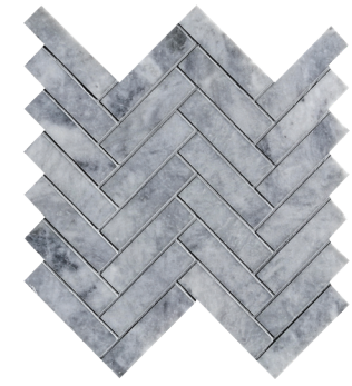
CS-Deep Blue Honed Herringbone Mesh 1 × 4