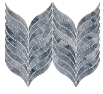
CS-Deep Blue Honed Feather Mesh