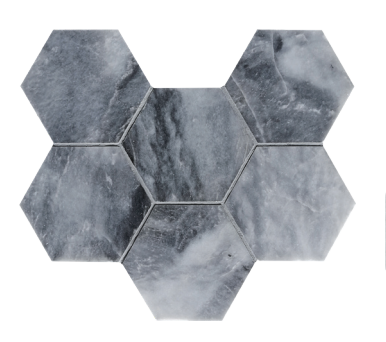
CS-Deep Blue Honed Hex 4 Inch Mesh