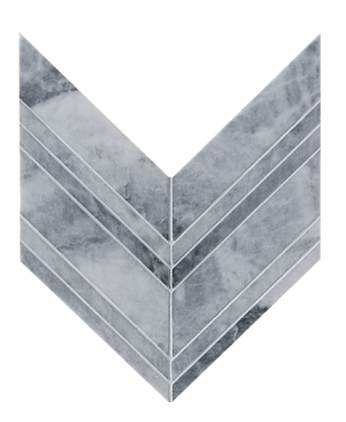
CS-Deep Blue Honed Chevron Mesh