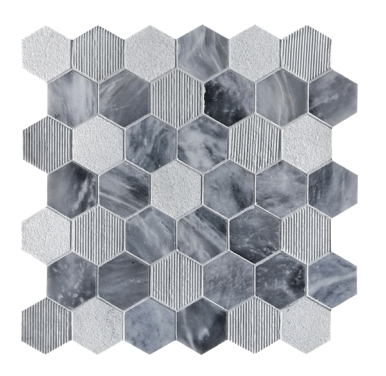
CS-Deep Blue Multi Finish 2 \times 2 Hex Mesh