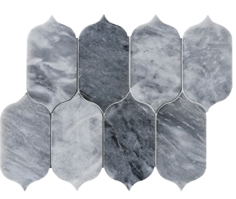
CS-Deep Blue Honed Lotus Mesh