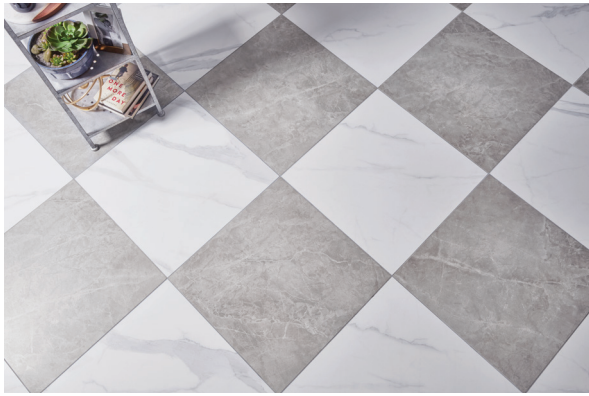
Themar Grigio Savoia & Statuario V