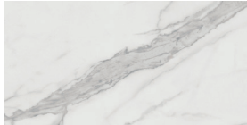
12 x 24