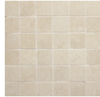
2 x 2