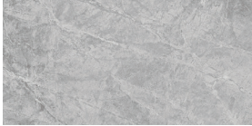
12 x 24