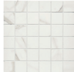
2 x 2