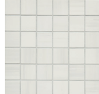
2 x 2