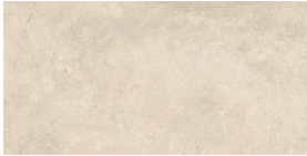
12 x 24