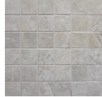
2 x 2